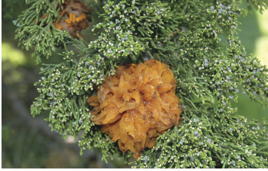
Cedar apple rust gall on juniper. NP