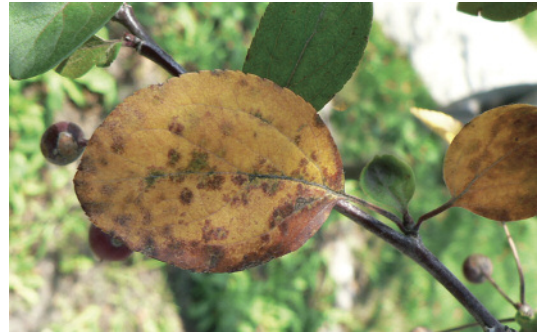
Apple scab on crabapple. JS