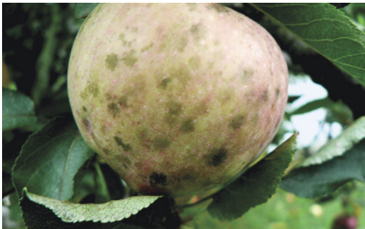
Apple scab lesions on fruit. JS