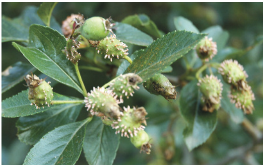
Cedar quince rust. NP