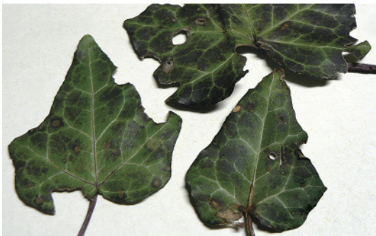
Alternaria leaf spot on ivy. JS