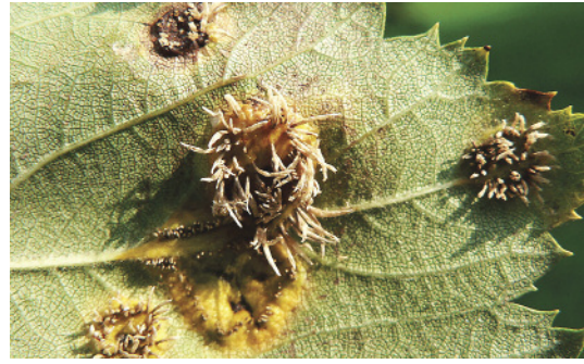
Aecial stage of rust on hawthorn. JS