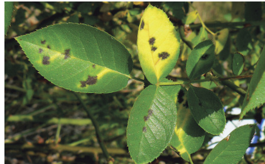
Black spot on rose. JS