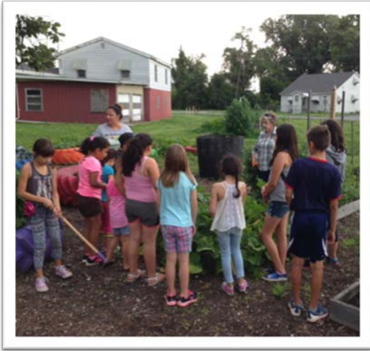
Fairmont City Library Community Gardens

Projects representing Adams, Cook, DuPage, LaSalle, McHenry, Ogle, Peoria, St. Clair and White Counties received funds raised through silent auction during MG State Conference. An example of the powerful projects is the Fairmont City Library Community Garden in St. Clair County.